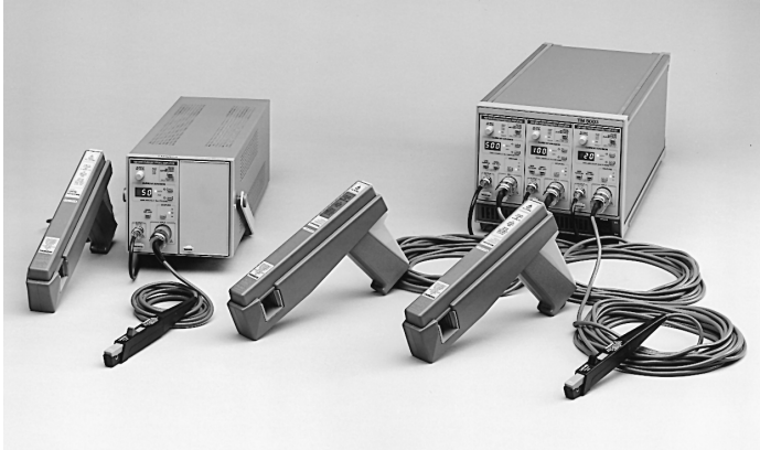
AM503 Current Measurement Family